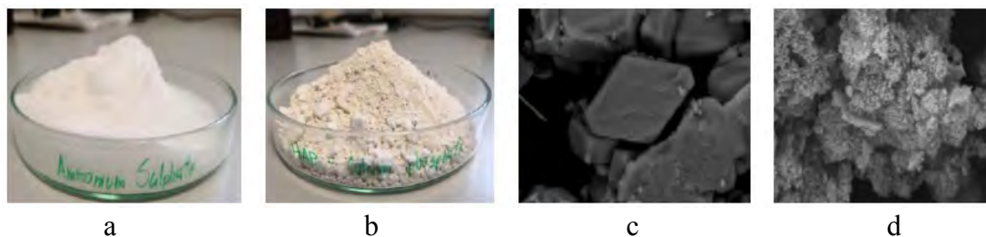
Figure 2.2 Recovered products: ammonium sulphate (a) and calcium phosphate (b); SEM images of recovered crystalline products: ammonium sulphate (c) and calcium phosphate (d)

ACKNOWLEDGMENTS This project has received funding from the Europe Union's Horizon 2020 research and innovation programme under grant agreement No 690323.