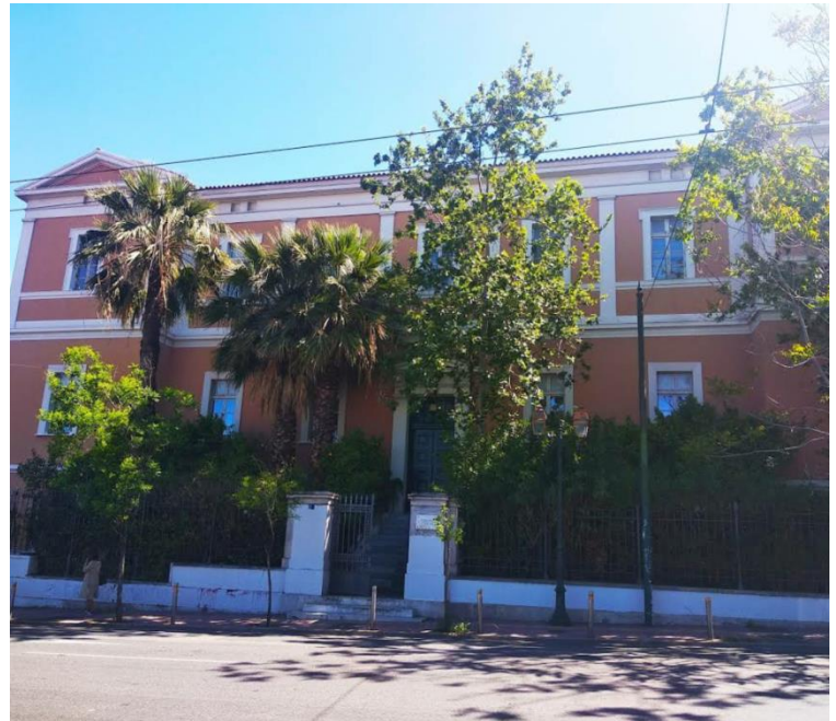
Kostis Palamas Building