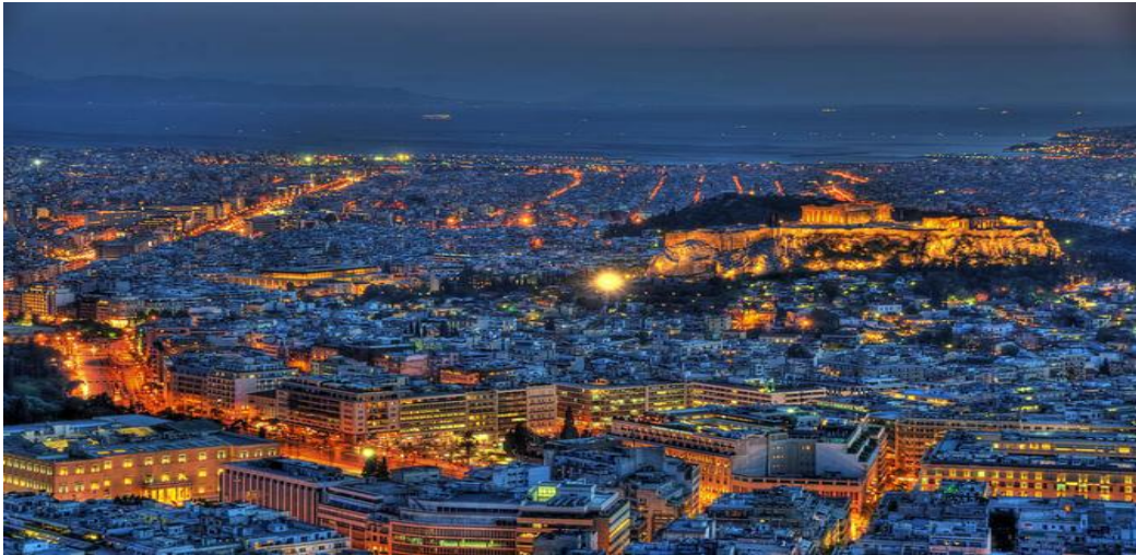
Panoramic view of Athens city

– to a significant extent – the ancient landscape. Several monuments where Aristotle, Plato, Pericles, and others were once walking still exist today and invite you to enjoy the Hellenic Sun and the unique verve of the Athenians.