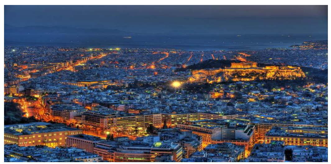
Panoramic view of Athens city

to a significant extent – the ancient landscape. Several monuments where Aristotle, Plato, Pericles, and others were once walking still exist today and invite you to enjoy the Hellenic Sun and the unique verve of the Athenians.