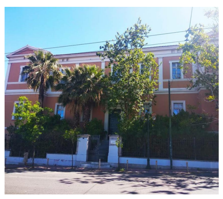
Kostis Palamas Building