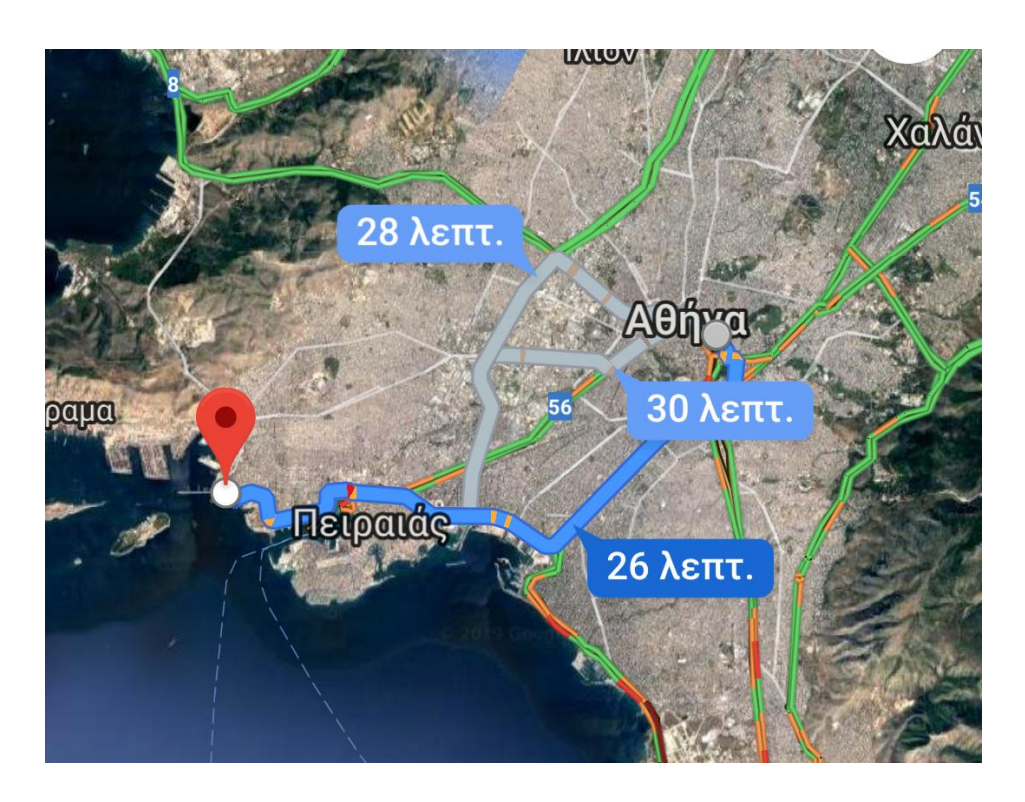
Distance from Kostis Palamas Building to Psyttalia WWTP